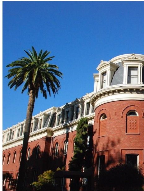
Sacred Heart Schools, Atherton, California, USA