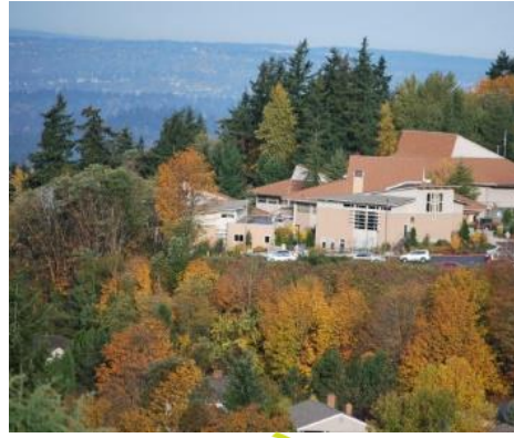
FOREST RIDGE SCHOOL OF THE SACRED HEART