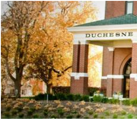
Duchesne Academy of the Sacred Heart, Omaha, Nebraska, USA