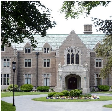
Newton Country Day School of the Sacred Heart, Boston, Massachusetts, USA