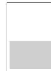
Half Page Horizontal